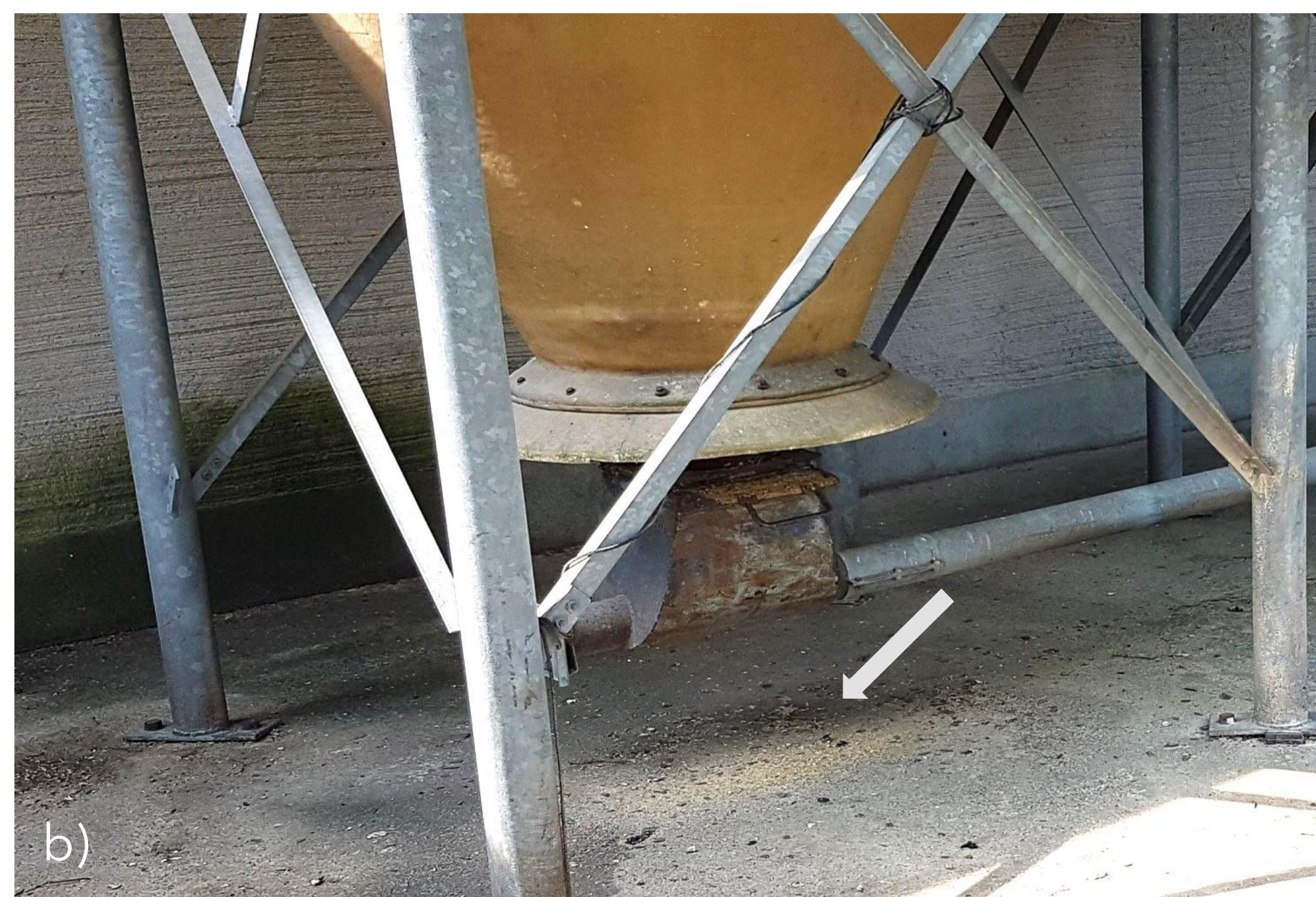
Figure 1: Different level of hygiene at feed silo: a. very clean, b. presence of feed spillage and bird droppings.

” We can't do anything more than we are doing with manageable costs. ” The virus is airborne and comes through the ventilation. ” We try to not take hay from areas with bird droppings.