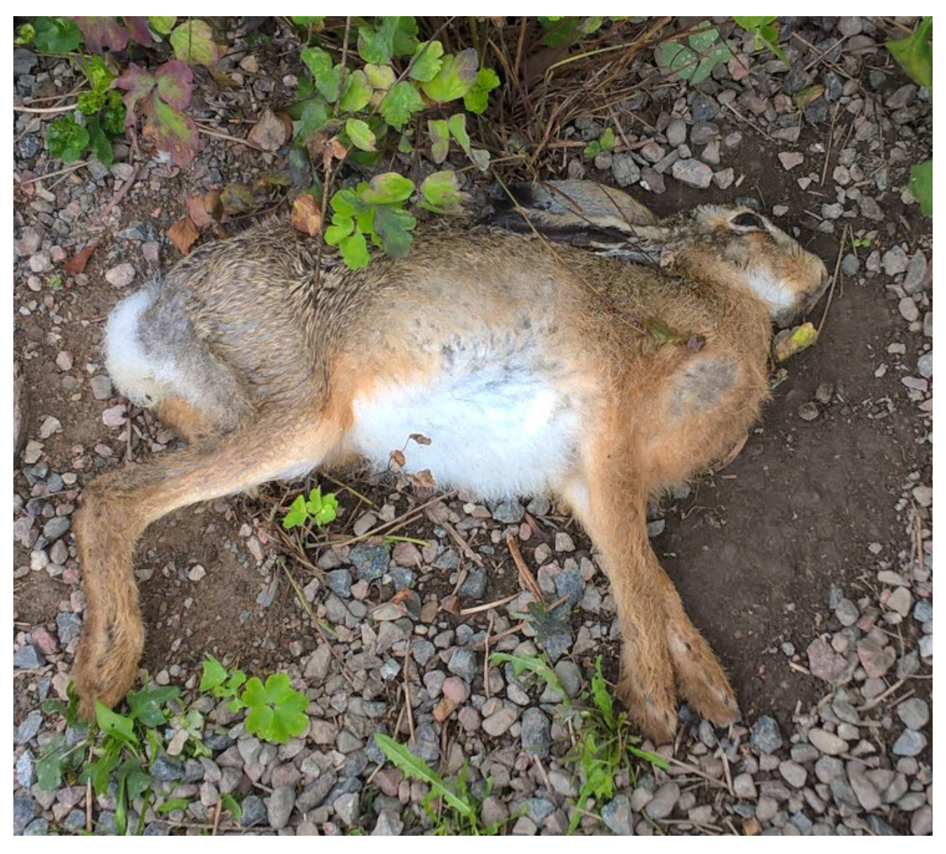
Figure 59: Dead European brown hare reported by the public. In 2022, Francisella tularensis was detected in 5 European brown hares and 3 mountain hares.

Hares and other animals are probably infected by the same routes as humans even if it is difficult to prove. Lesions in the skin are difficult to find in furred animals, but in some hare cases the infection sites have been confirmed by finding still attached ticks and pathology corresponding to tularaemia. In hares with pneumonia a respiratory route might be suspected. In wildlife species that are more resistant to developing disease upon infection, e.g., carnivores and omnivores, F. tularensis has been found in lymph nodes in the jaw region suggesting infection through contaminated food or water.